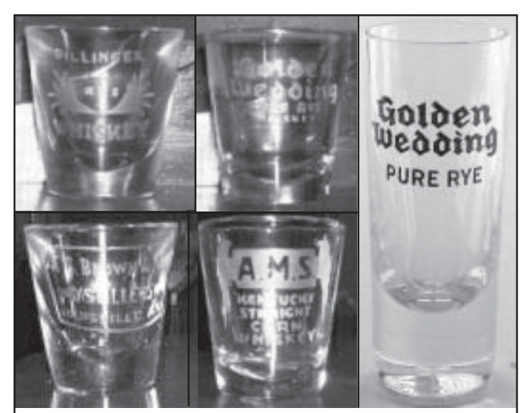
Figure 8. A gathering of some of the reproductions that have appeared on eBay. The Golden Wedding shooter on the far right is the genuine article and presumably served as the model for the reproduction at its side (top center).